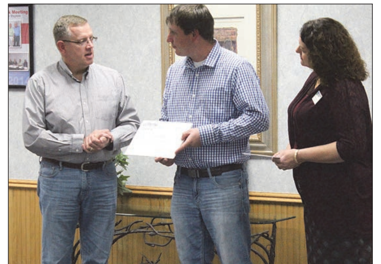
1119 gold 'n plump rebate check

Call Janice Fick at 283-9846 to make dining reservations or for home-delivered meals.