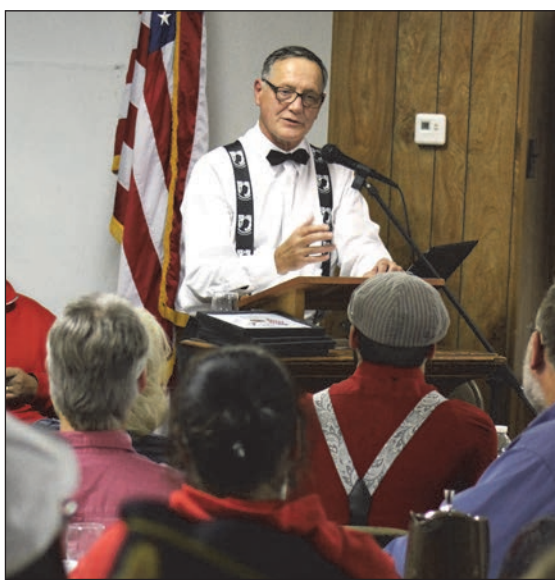
1119 Hardwick Vets Program

"All veterans are really like brothers. We all fought for a