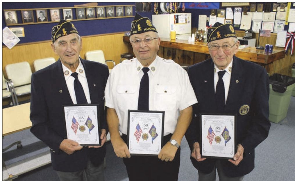
Hardwick Vets Program