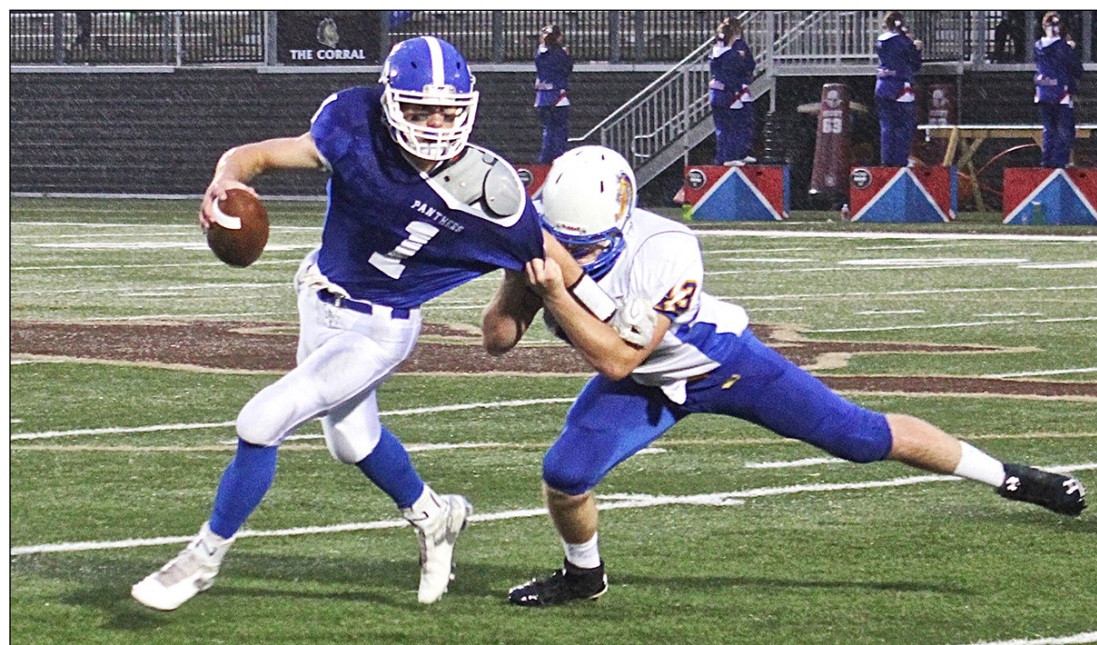
John Rittenhouse photo/1029 afb 8

The 10 th -seeded Dragons took on No. 7 H-BC during the opening round of the South Section 3A Tournament Tuesday (Oct. 27) in Hills.