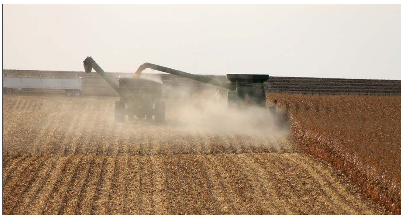
1029 Corn Harvest 2015

In addition, officers responded to 1 motor vehicle accident, 1 deer accident, 2 funeral escorts, 14 ambulance runs, 2 parking violations, 2 paper services, 2 animal complaints, 2 fingerprint requests, 7 log/alarm sheets, 5 drug court tests, and issued 4 purchase/carry permits and 3 burn permits.