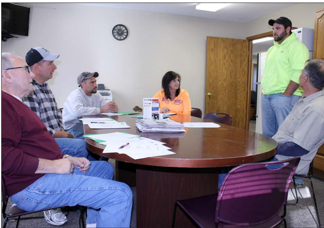
New LMO Technician