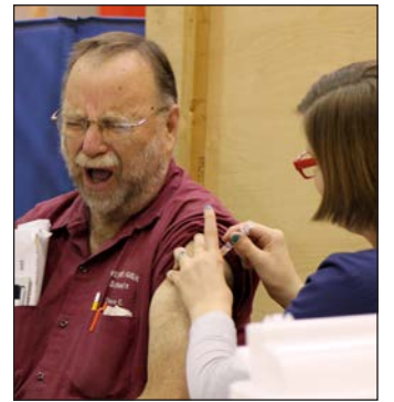
1029 Flu Shots

The flu vaccine can help keep those who are immu-