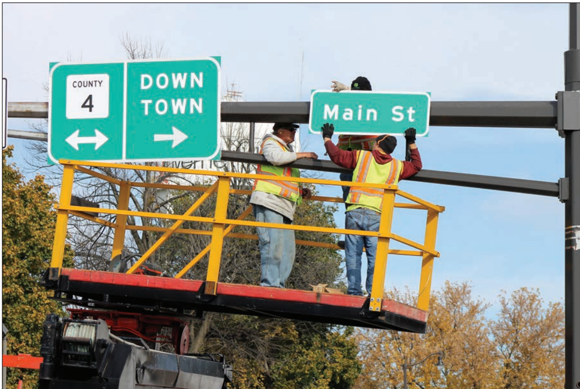
1029 Hwy 75 Main Street Signage