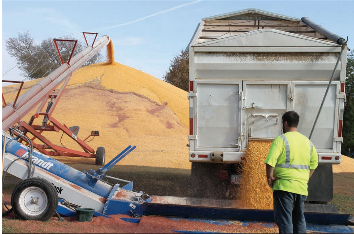
1029 Corn Harvest 2015

Based on rainfall measured at Quentin Aanensen Field — Luverne Municipal Airport, the area has received more than 22 inches of rain since March. The most rainfall (5.45