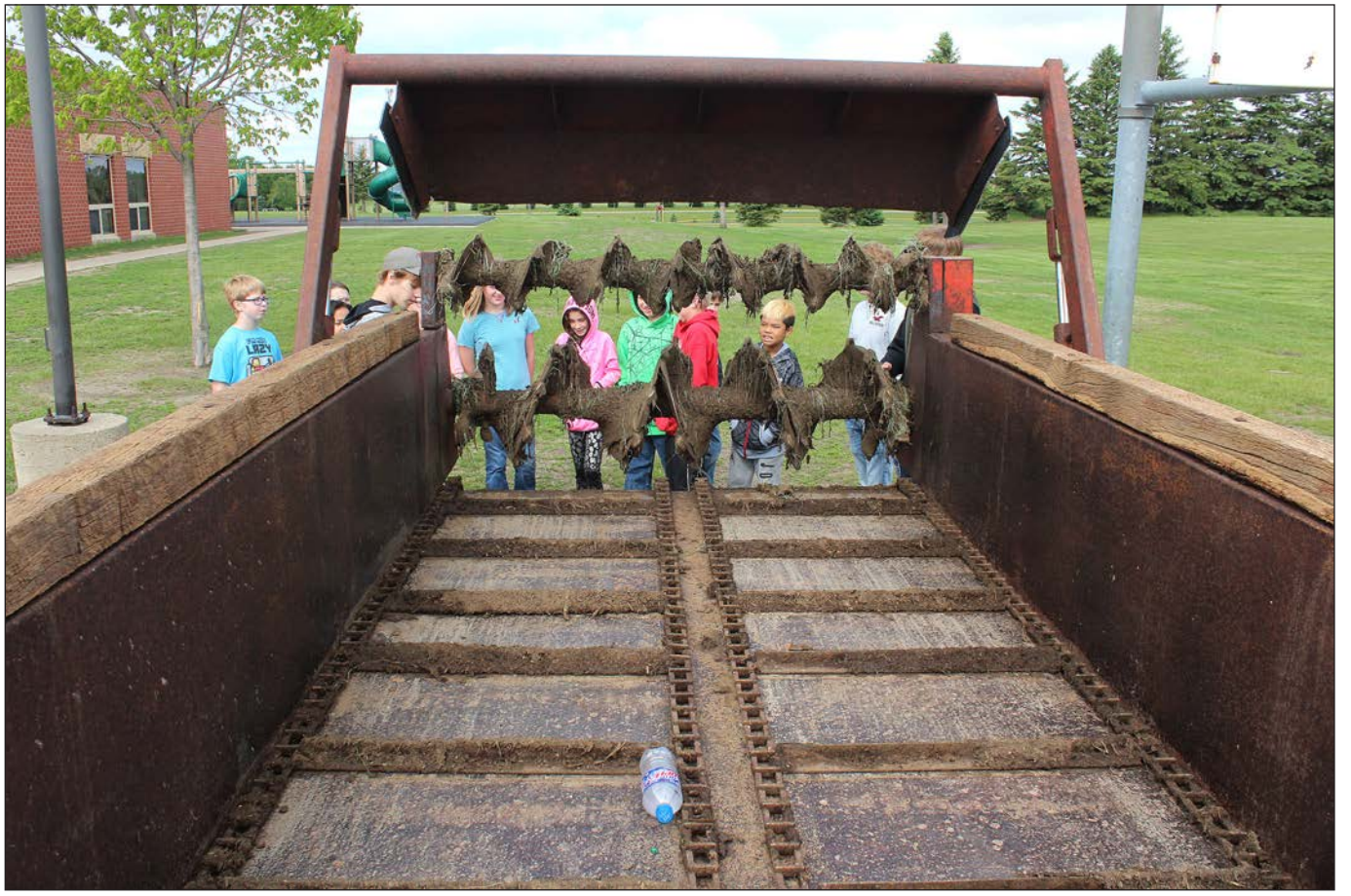
0601 farm safety