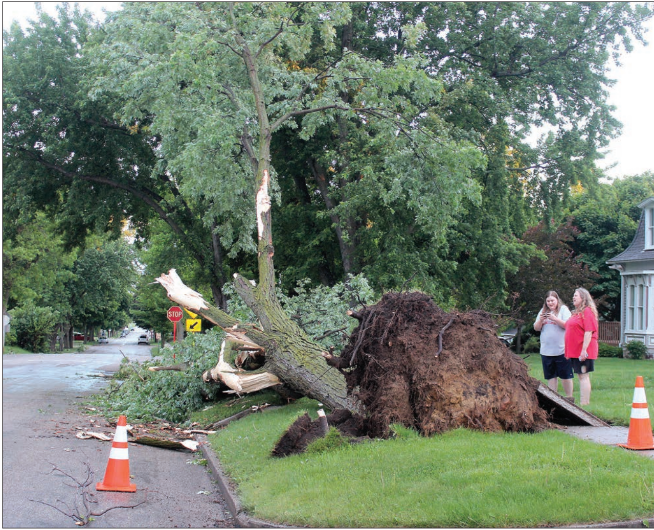
Lori Sorenson photo/0601 storm damage

"Strong wind — 60 to 80 mph — came through here and grabbed all the debris, just like bullets going through the windows," said Micky