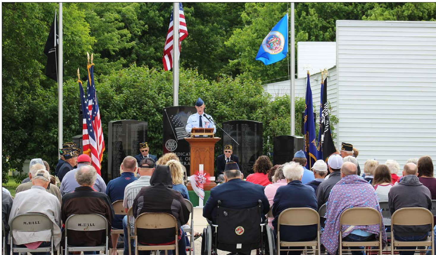
0601 Hardwick Memorial 2017

Luverne Community Education is offering a chartered bus trip to see the Minnesota Twins vs. Cleveland Indians game June 18. Cost is $88 per person for the bus and the game. Call 283-4724 with questions.