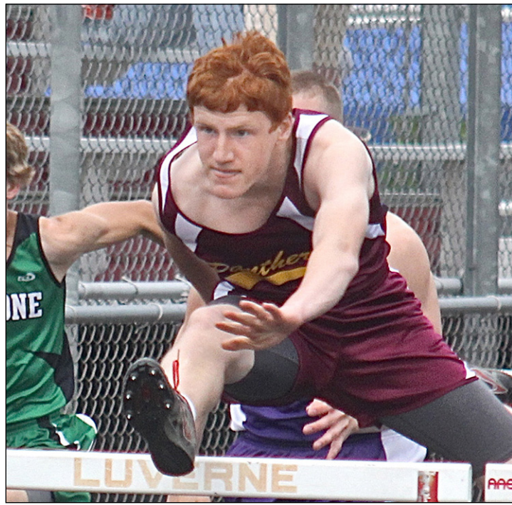
0601 ellsworth track 1

Ellsworth's Sean Boltjes placed second in the 110- and 300-meter hurdles during the sub-section meet in Luverne.