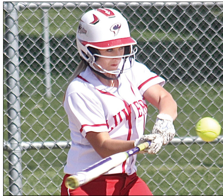
0511 softball 4

Luverne plays at the Heron Lake-Okabena Tournament Saturday.