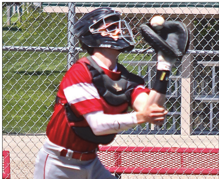
0511 redbirds 2