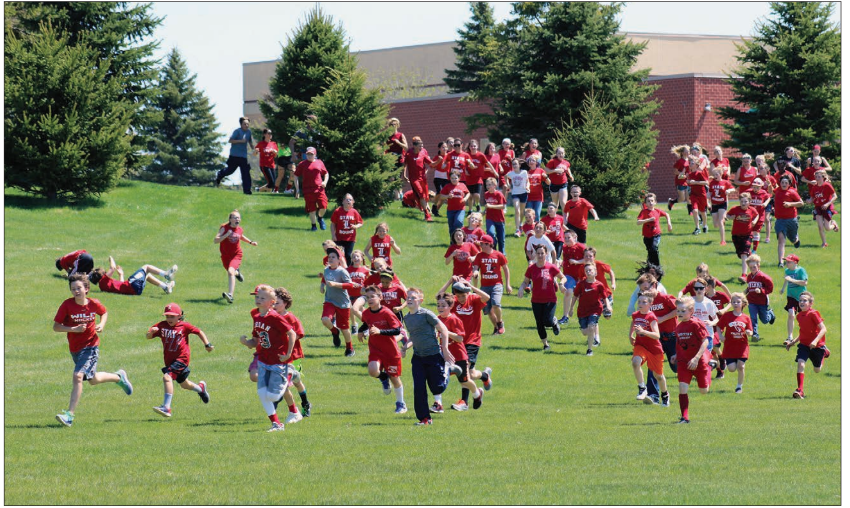
Cardinal Dash

Fifth-graders begin the Third Annual PPIE Cardinal Dash: Keep Kids Running event in upper 70-degree temperatures Friday afternoon, May 5, behind the Luverne Elementary School. The goal for the fundraiser was $15,000. The dash raised $17,244.