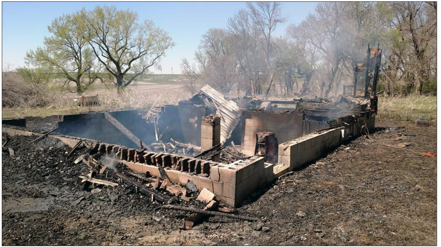
0511 Hardwick Fire May 6

In addition, officers responded to 16 traffic stops, 2 funeral escorts, 5 drug court requests, 3 911 misdials, 2 accidents, 8 animal complaints, 13 ambulance requests, 6 paper services, 2 transports, 2 vehicles in ditch, 1 money escort, 5 background checks, 1 Log alarm, 2 POR registrations, and issued 4 permits to carry, 1 permit to purchase, and 23 burn permits.