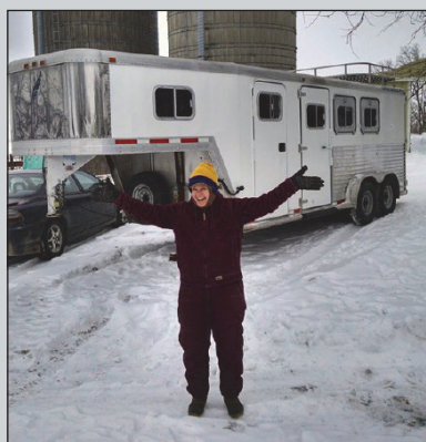
Me and the trailer, Jan. 2016