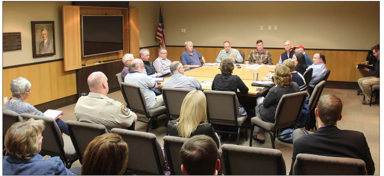
0511 walz tour