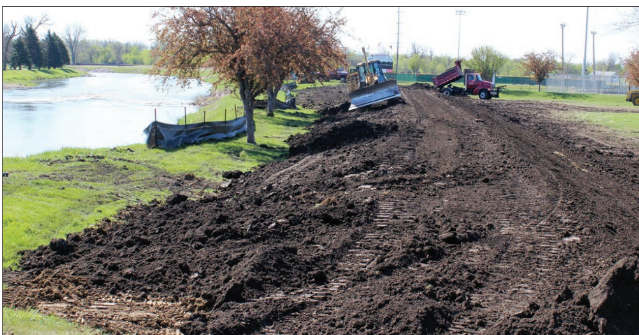
0511 berm work