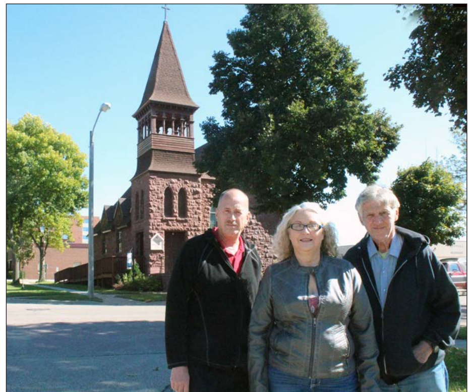
holy trinity church to close

She declined to name the buyer until closing documents are signed at the end of the month.