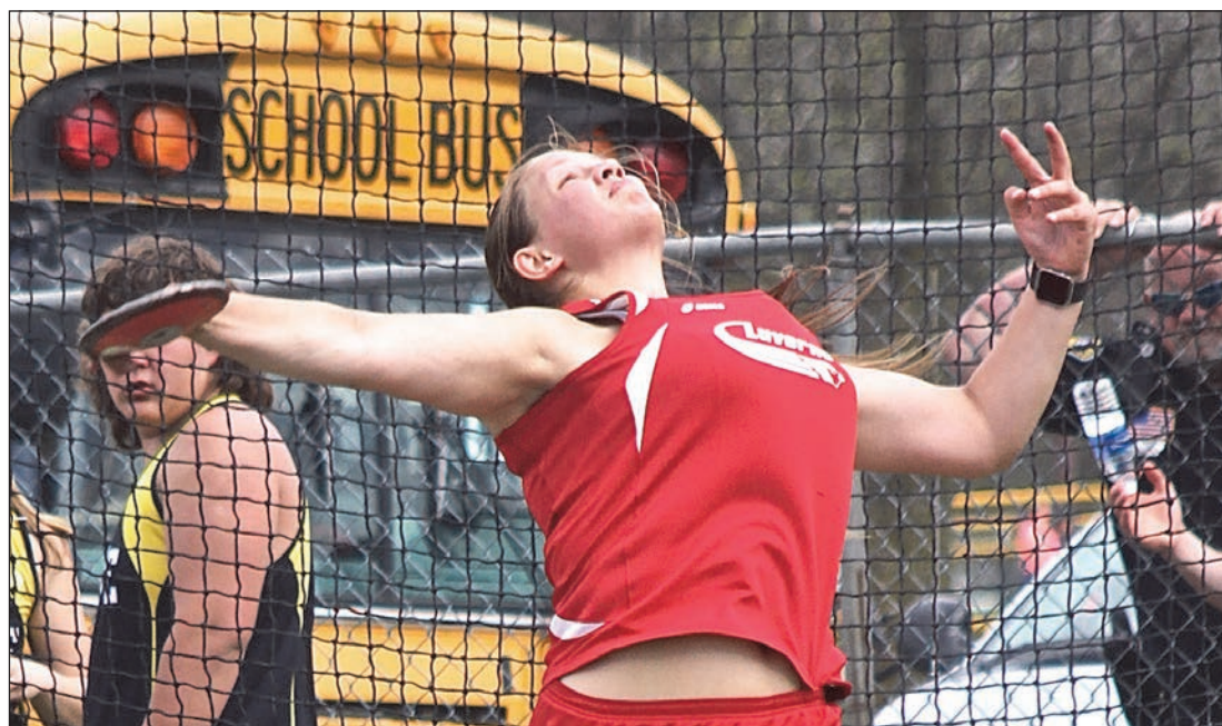
0511 girls 5

Hills-Beaver Creek, Adrian and Ellsworth placed sixth, 13 th and 14 th with 509.5, 321 and 51 points respectively.