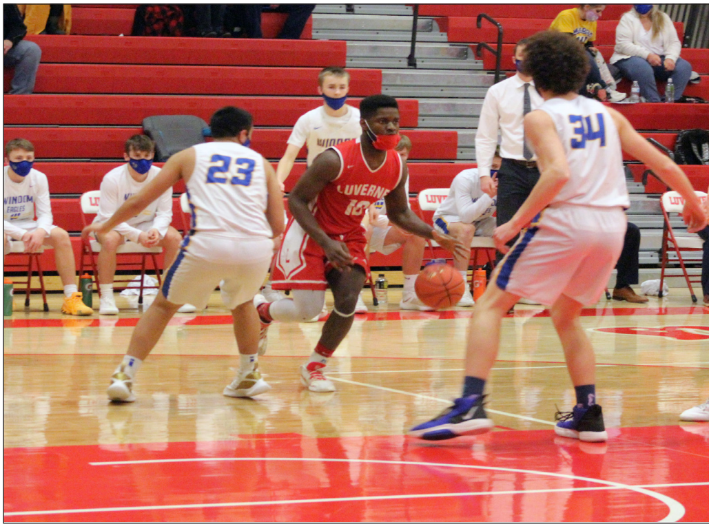
0304 LHS BB