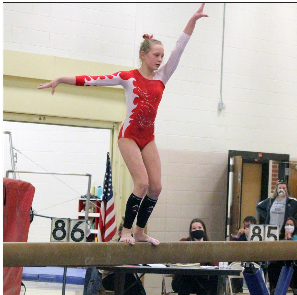
Gymnastics