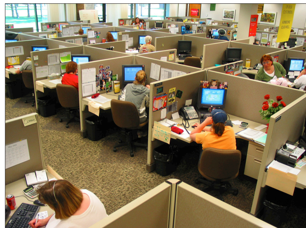
Employees work in their offices in the newly remodeled former Tri-State Insurance building in Luverne in 2005.

When the building was last occupied, it paid about $33,000 in property taxes.