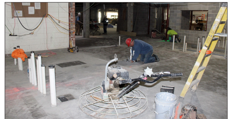
Workers check the plumbing for the various work stations in the new Luverne Middle-High School kitchen Feb. 24.