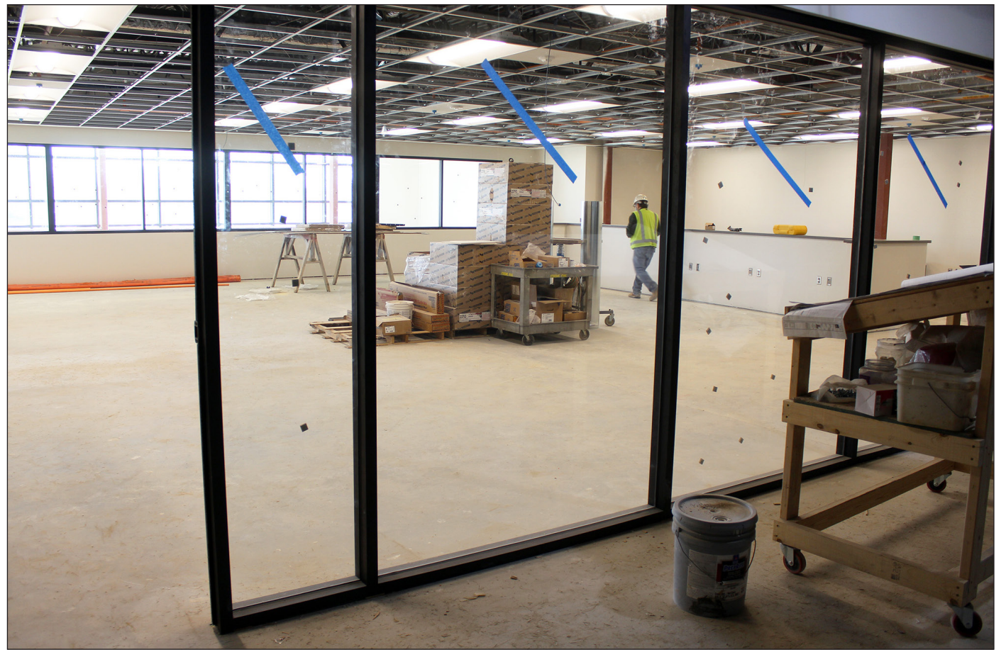
School Build Media Center

stolen package. •Complainant requested investigation assistance. •Complainant reported a phone scam. •Suspicious activity was reported on N. Kniss Avenue. Feb. 24 •Complainant on W. Adams Street reported threatening behavior. •Complainant on Sioux Valley Drive reported threatening behavior. •Complainant on S. Kniss Street requested deputy at location. •Complainant westbound on Interstate 90, mile marker 11, Luverne, reported debris on the roadway. •Complainant westbound on Interstate 90, mile marker 1, Beaver Creek, reported debris on roadway. •Complainant on 131st Street, Luverne, reported a vehicle complaint. Feb. 25 •Complainant on W. Lawn Park reported suspicious vehicle parked near location. •Complainant eastbound on Interstate 90, mile marker 1, Valley Springs, reported a driving complaint. •Complainant reported harassing phone issues. •Suspicious activity was reported on S. Kniss Avenue. Feb. 26 •Complainant on County Highway 4 and 100th, Luverne, reported a vehicle with their flashers on. In addition, officers responded to 3 motor vehicle accidents, 4 deer accidents, 1 vehicle in ditch, 8 escorts, 29 ambulance runs, 1 parking violation, 4 paper services, 5 animal complaints, 1 fingerprint request, 13 burn permits, 2 vehicle impounds, 1 background check, 3 gas drive-offs, 2 alarms, 17 purchase and carry permits, 16 traffic stops, 15 abandoned 911 calls, 5 tests, 1 report of cattle out, 1 OFP and 1 follow-up.