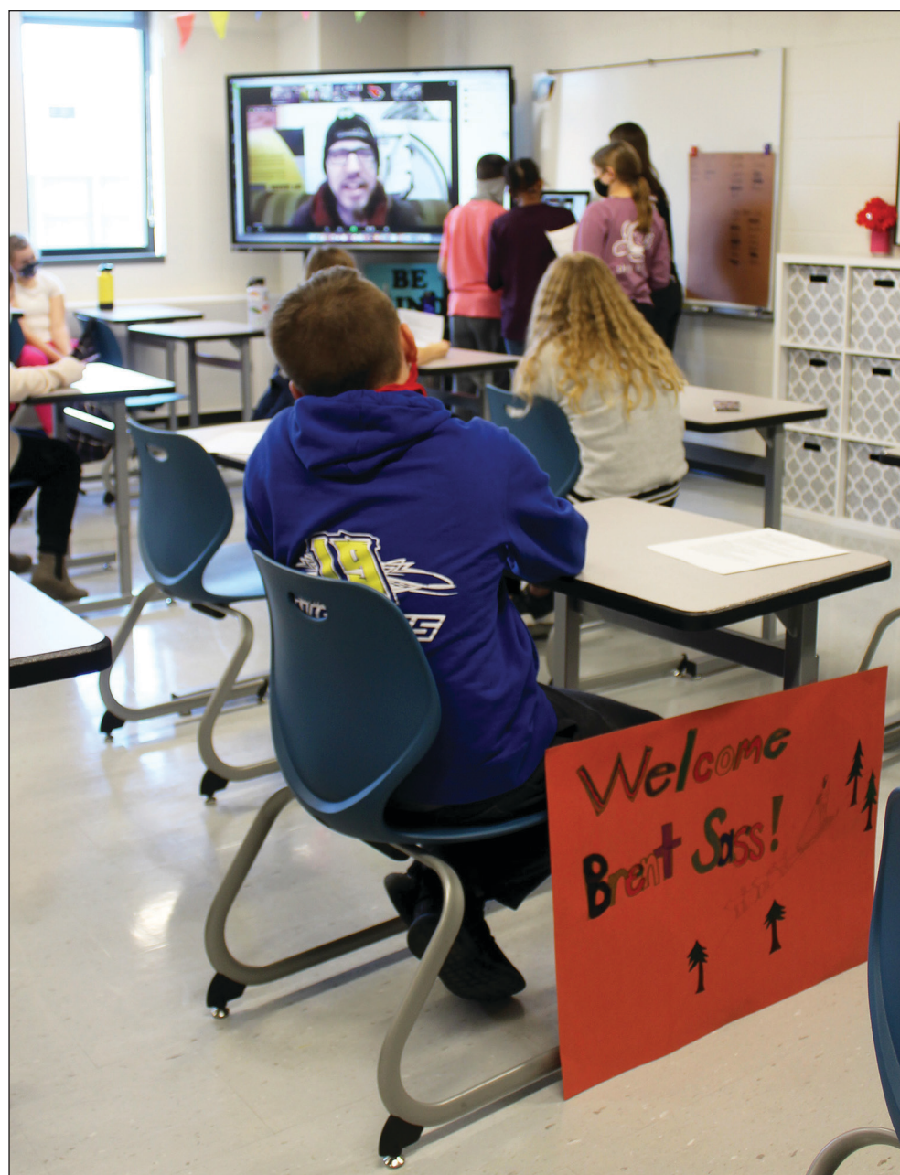
0304 Iditarod Lesson

English lesson takes sixth-graders into this year's Alaskan sled dog race