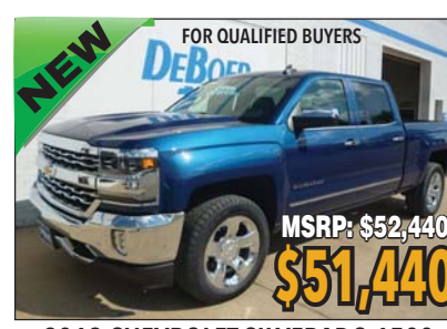
2018 CHEVROLET SILVERADO 1500 LTZ PLUS PKG, SPORT PKG #1831