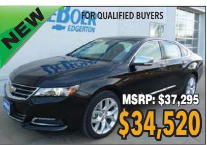
2018 CHEVROLET IMPALA PREMIER, STYLE & TECH PKG #1853