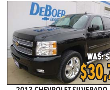
2013 CHEVROLET SILVERADO 1500 LTZ, PLUS PKG, HTD & CLD SEATS, 14K #1848A