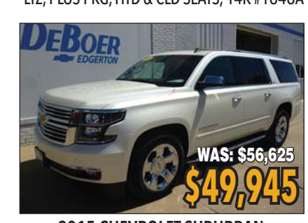
2015 CHEVROLET SUBURBAN LTZ, DESTINATION PKG, DUAL DVD, 49K #A1726