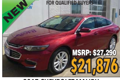
2017 CHEVROLET MALIBU LT #17101