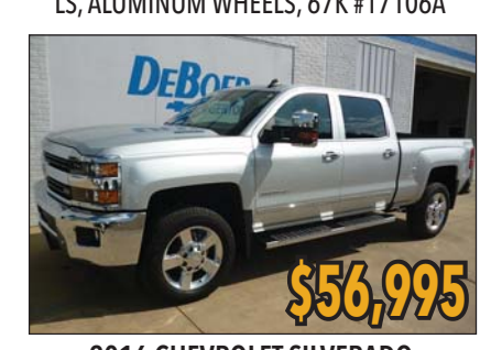
2016 CHEVROLET SILVERADO LTZ, DURAMAX PLUS PKG, Z71, 12K #17110A