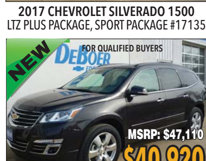
2017 CHEVROLET TRAVERSE PREMIER #1799