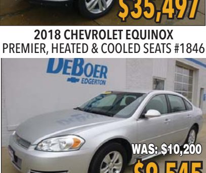
2013 CHEVROLET IMPALA LS, ALUMINUM WHEELS, 67K #17106A