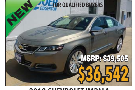
2018 CHEVROLET IMPALA PREMIER #1813