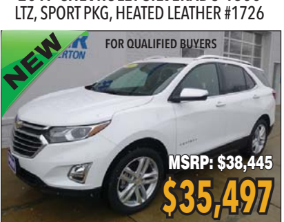
2018 CHEVROLET EQUINOX