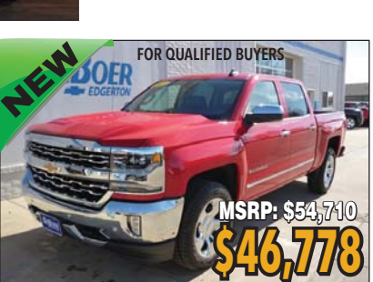
2017 CHEVROLET SILVERADO 1500