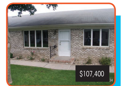
118 W WARREN, LUVERNE