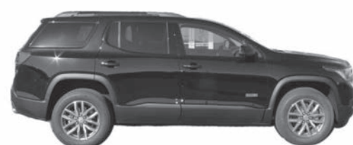
2018 GMC Acadia SLE-2