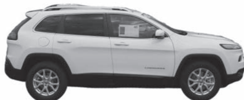
2018 Jeep Cherokee Latitude