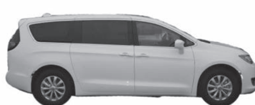
2018 Chrysler Pacifica Touring Plus