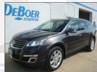
LT, AWD, TECH PKG, HEATED SEATS, TRAILER PKG, 49K #A1729