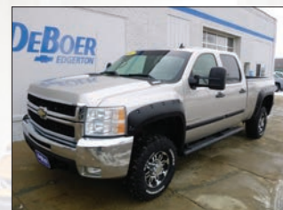
LT, DURAMAX, ALLISON, 132K #1857A