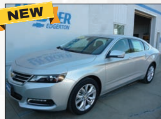
LT, STYLE & TECHNOLOGY PKG, LT CONVE-NIENCE PKG #1821