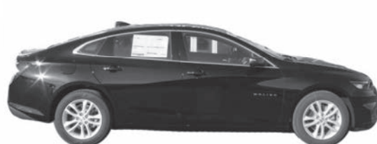
2018 Chevrolet Malibu LT