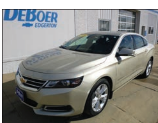
2014 CHEVROLET IMPALA

2LT W- CONVENIENCE PKG, SAFETY PKG, 82K #1813A MSRP: $16,700 $15,990