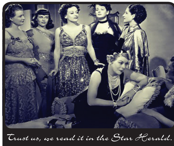
Trust us, we read it in the Star Herald.

Get your local news online www.Star-Herald.com