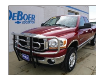
2006 DODGE RAM

SLT W- CUMMINGS TURBO DIESEL, 201K #1886A MSRP: $19,825 $17,995