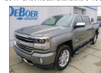
2017 CHEVROLET SILVERADO 1500

HIGH COUNTRY, HEATED-VENTED SEATS, 27K #18128A MSRP: $47,850 $45,285