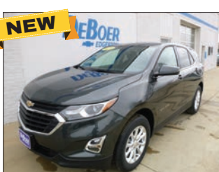
2018 CHEVROLET EQUINOX

LT, CONFIDENCE & CONVENIENCE PKG #18161 MSRP: $31,440 $30,140