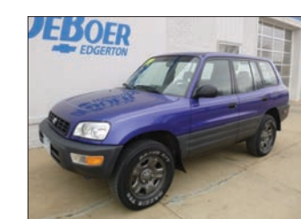
1999 TOYOTA RAV4

L, 4WD, 5 SPD., 157K #17108N MSRP: $5,475 $4,497