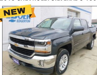
2018 CHEVROLET SILVERADO 1500

LT, ALL STAR PKG, TRAILER PKG, HEATED SEATS #18166 MSRP: $48,615 $38,971