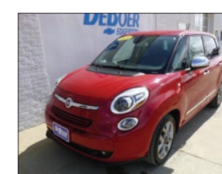
2014 FIAT 500L

LOUNGE, BEATS SOUND, HEATED SEATS, 18K #1895A MSRP: $14,625 $12,985