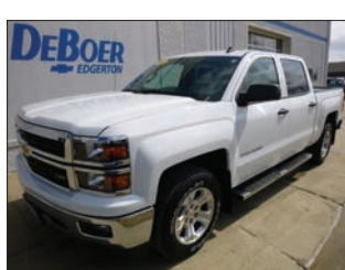
2014 CHEVROLET SILVERADO 1500

2LT, Z71 OFF ROAD PKG, ALL-STAR EDITION, TRAILER PKG, 44K #1830A MSRP: $30,300 $28,450