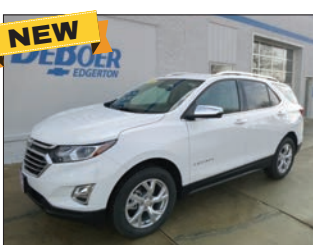
2018 CHEVROLET EQUINOX

PREMIER, DRIVER CONVENIENCE PKG, HEATED SEATS #1876 MSRP: $35,430 $33,908