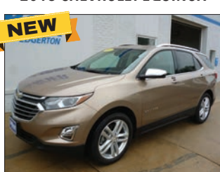
2018 CHEVROLET EQUINOX

PREMIER, DRIVER CONFIDENCE & CONVENIENCE PKG #1826 MSRP: $39,470 $35,439