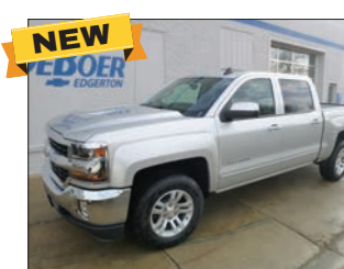
2018 CHEVROLET SILVERADO 1500

LT, ALL-STAR PACKAGE #1884 MSRP: $48,710 $38,954