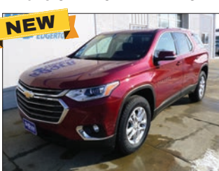
2018 CHEVROLET TRAVERSE

LT, MYLINK AUDIO SYSTEM #18114 MSRP: $35,890 $30,802