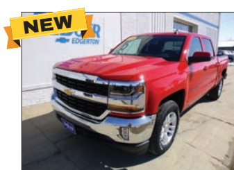
2018 CHEVROLET SILVERADO 1500

LT, ALL-STAR EDITION, REMOTE START #18152 MSRP: $48,260 $38,675