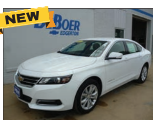
2018 CHEVROLET IMPALA

LT, CONFIDENCE & CONVENIENCE PKG #18161 MSRP: $31,440 $30,140