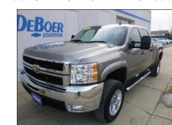
2007 CHEVROLET SILVERADO 2500HD

2LT DURAMAX, AUDIO PKG, TRAILER PKG, BOSE, 189K #1846B MSRP: $24,600 $22,450