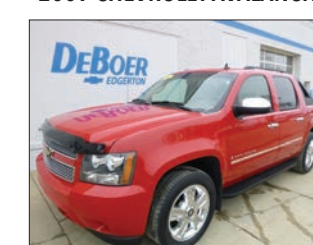
2009 CHEVROLET AVALANCHE

LIZ, HEATED-VENTED SEATS, REMOTE START, 120K #1851B MSRP: $19,450 $18,945