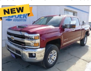
2018 CHEVROLET SILVERADO 2500HD

LIZ, DURAMAX, Z71 PKG, HEATED-COOLED SEATS #18149 MSRP: $67,495 $66,995