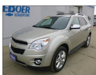
2014 CHEVROLET EQUINOX

LIZ, CHROME PKG, HTD LEATHER, REMOTE START, 46K #18131A MSRP: $20,675 $19,875