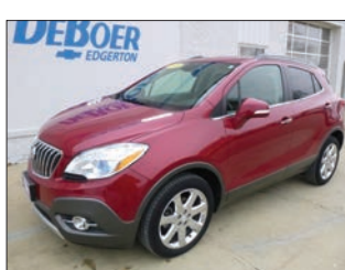
2014 BUICK ENCORE

LEATHER, PREMIUM PKG, MEMORY PKG, SUNROOF, 39K #A1731 MSRP: $18,865 $16,995