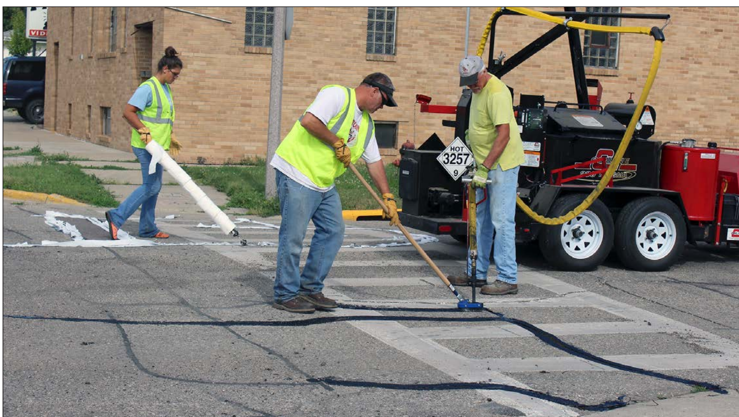
City Street Repairs

Sponsored by First Farmers & Merchants National Bank and Papik Motors, a free, family-friendly movie is shown on the first Thursday of every month as it was done for "Bank Nite" in the 1930s. A cash prize drawing will follow the movie. Must be present to win.