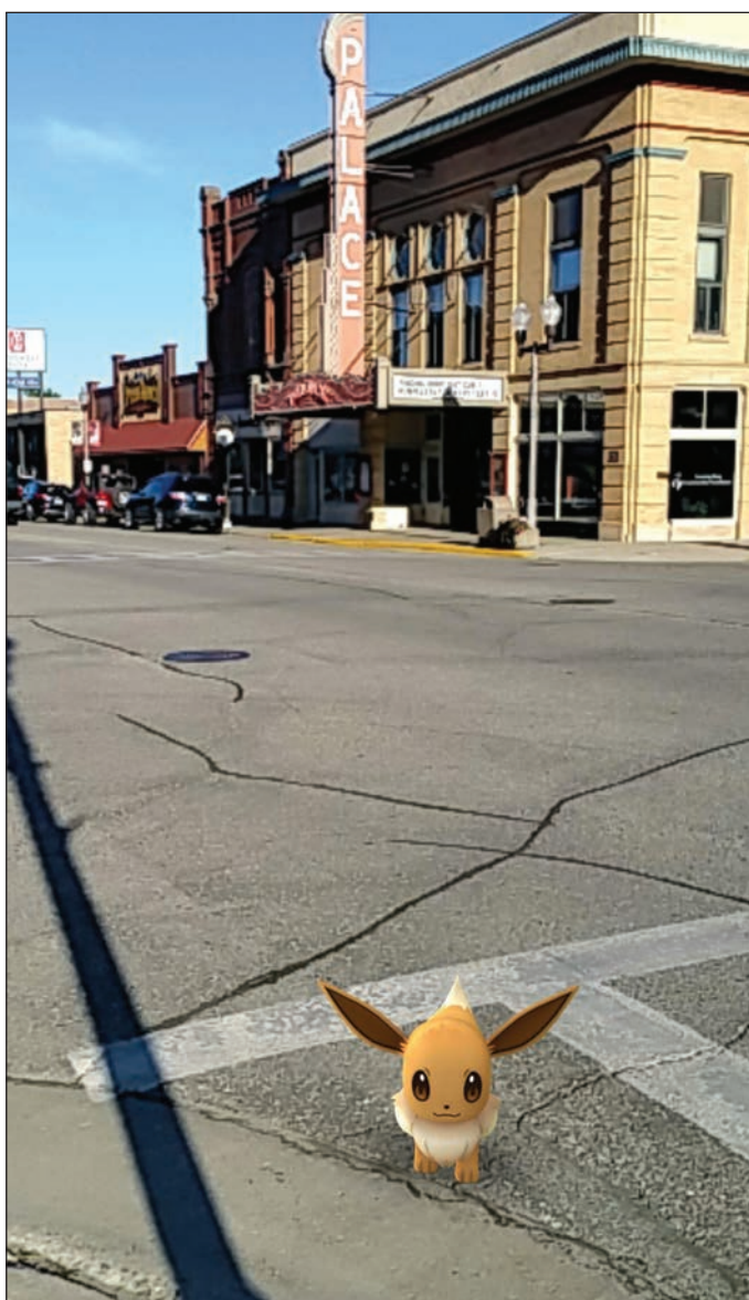
A virtual Pokemon character is captured in a screen shot on Main Street near the Palace Theatre in Luverne.